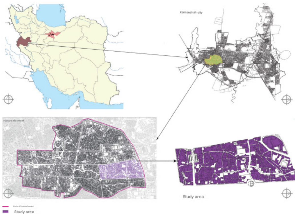
Figure 2. Study area